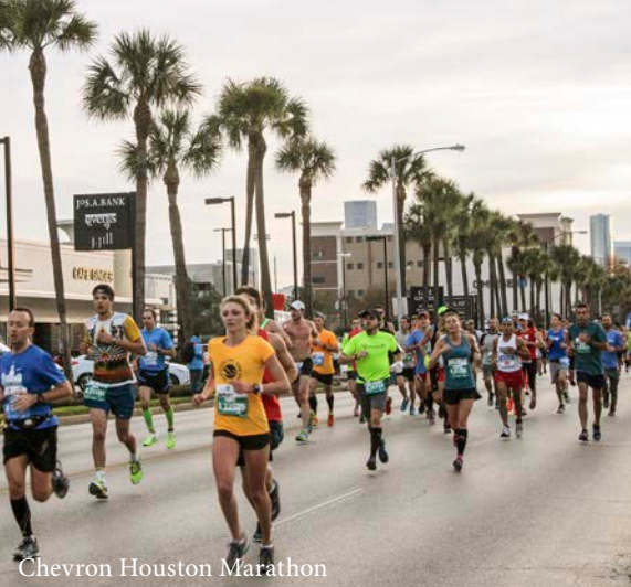
Chevron Houston Marathon