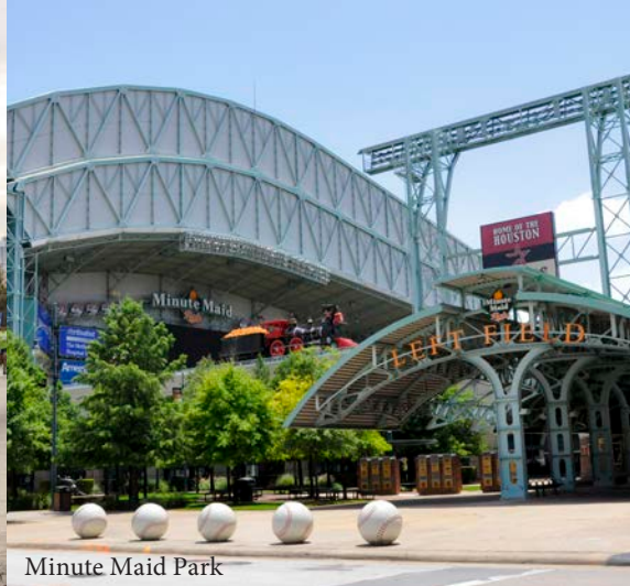
Minute Maid Park