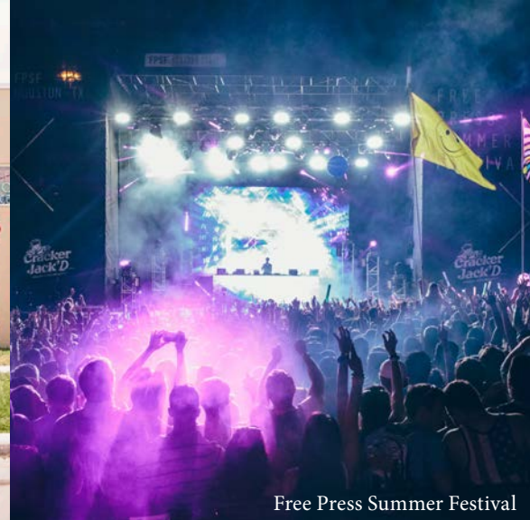
Free Press Summer Festival