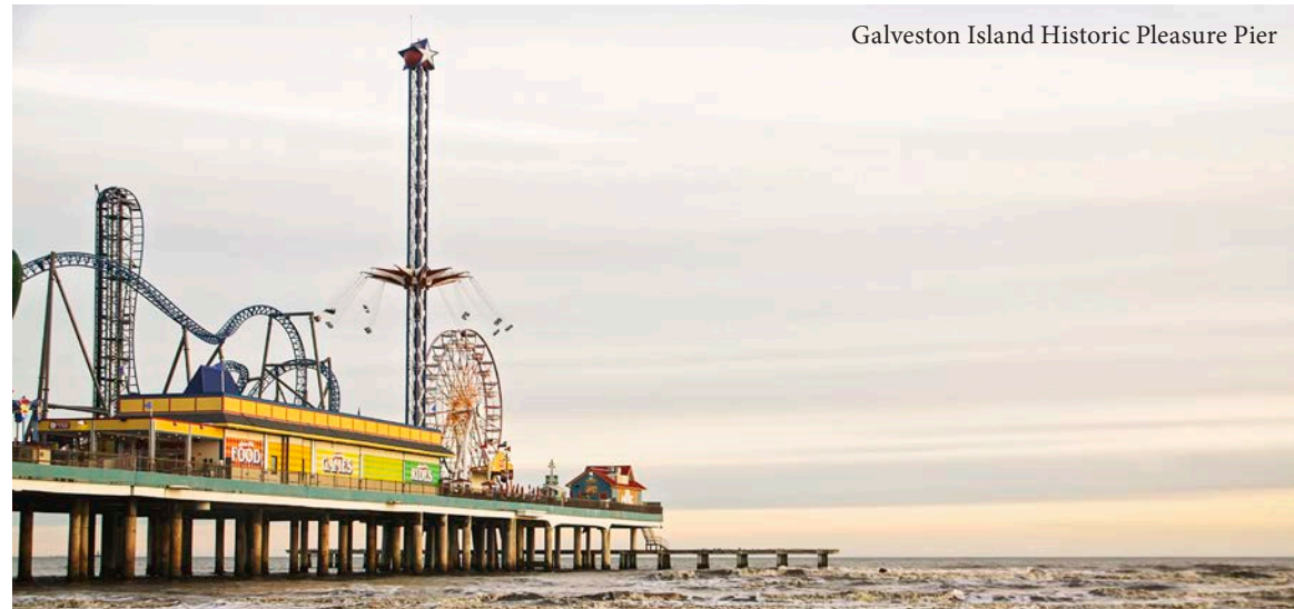
Galveston Island Historic Pleasure Pier