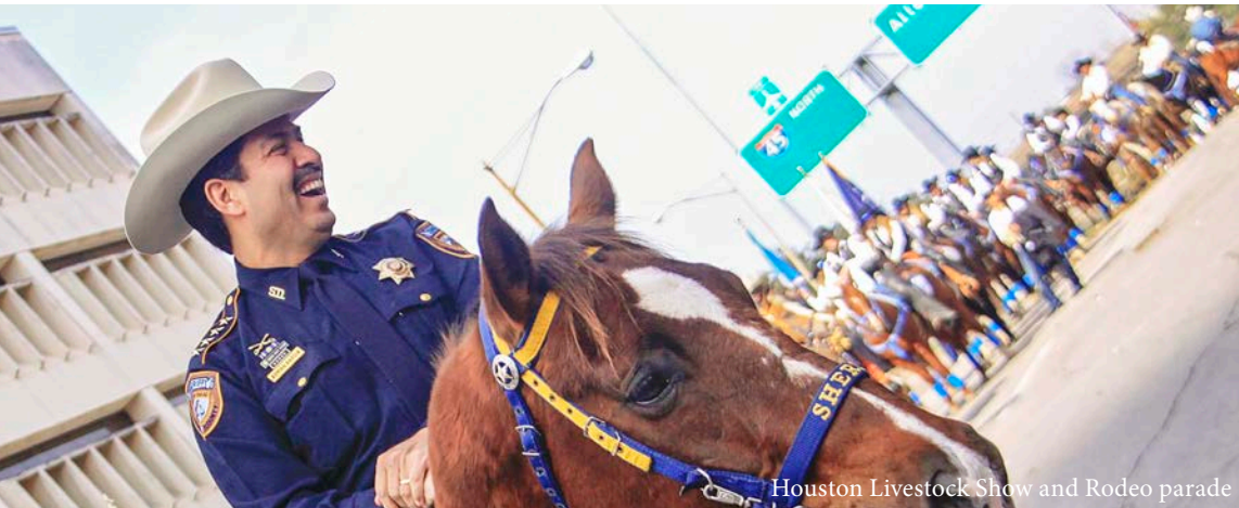
Houston Livestock Show and Rodeo parade