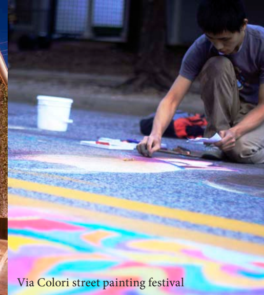
Via Colori street painting festival