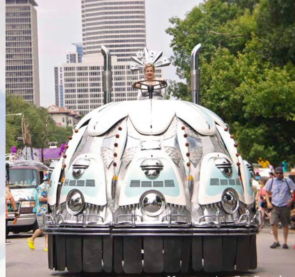
Houston Art Car Parade