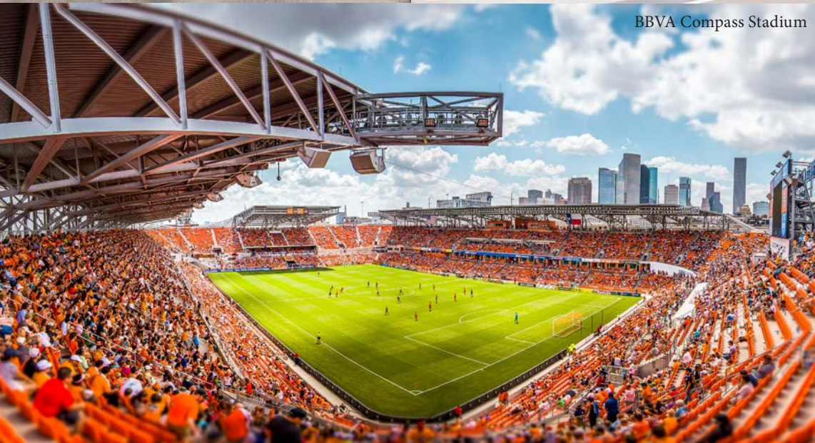
BBVA Compass Stadium