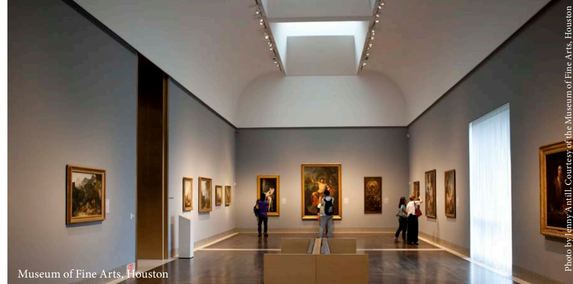
Museum of Fine Arts, Houston