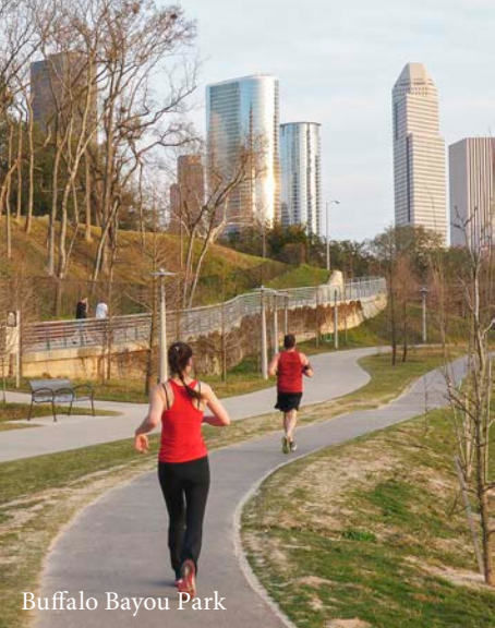
Buffalo Bayou Park