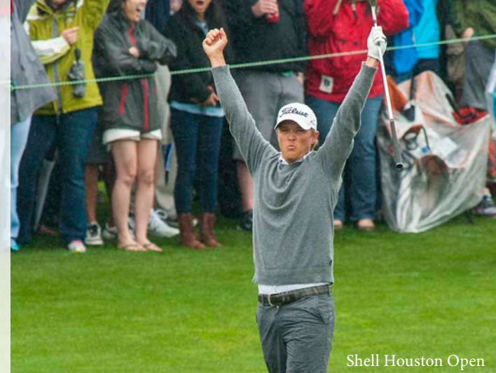
Shell Houston Open

Houston is home to a variety of professional sports teams, including the Astros (Major League Baseball), Texans (National Football League), Rockets (National Basketball Association), Dynamo (Major League Soccer) and Dash (National Women's Soccer League).