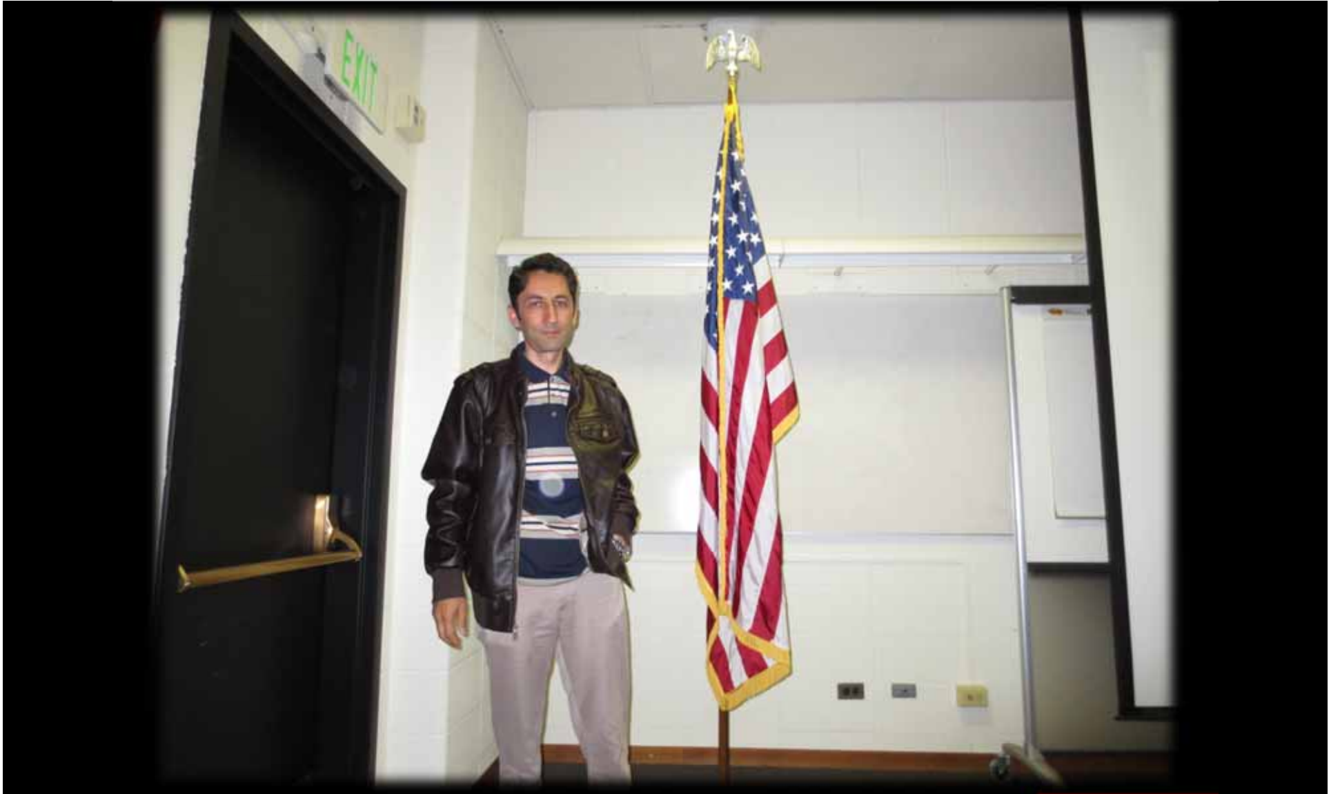
Necati YAMAC TURKEY