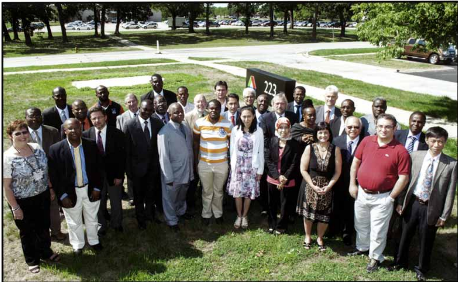
IAEA/Argonne Training Course on Leadership and Management for Introducing and Expanding Nuclear Power Programmes