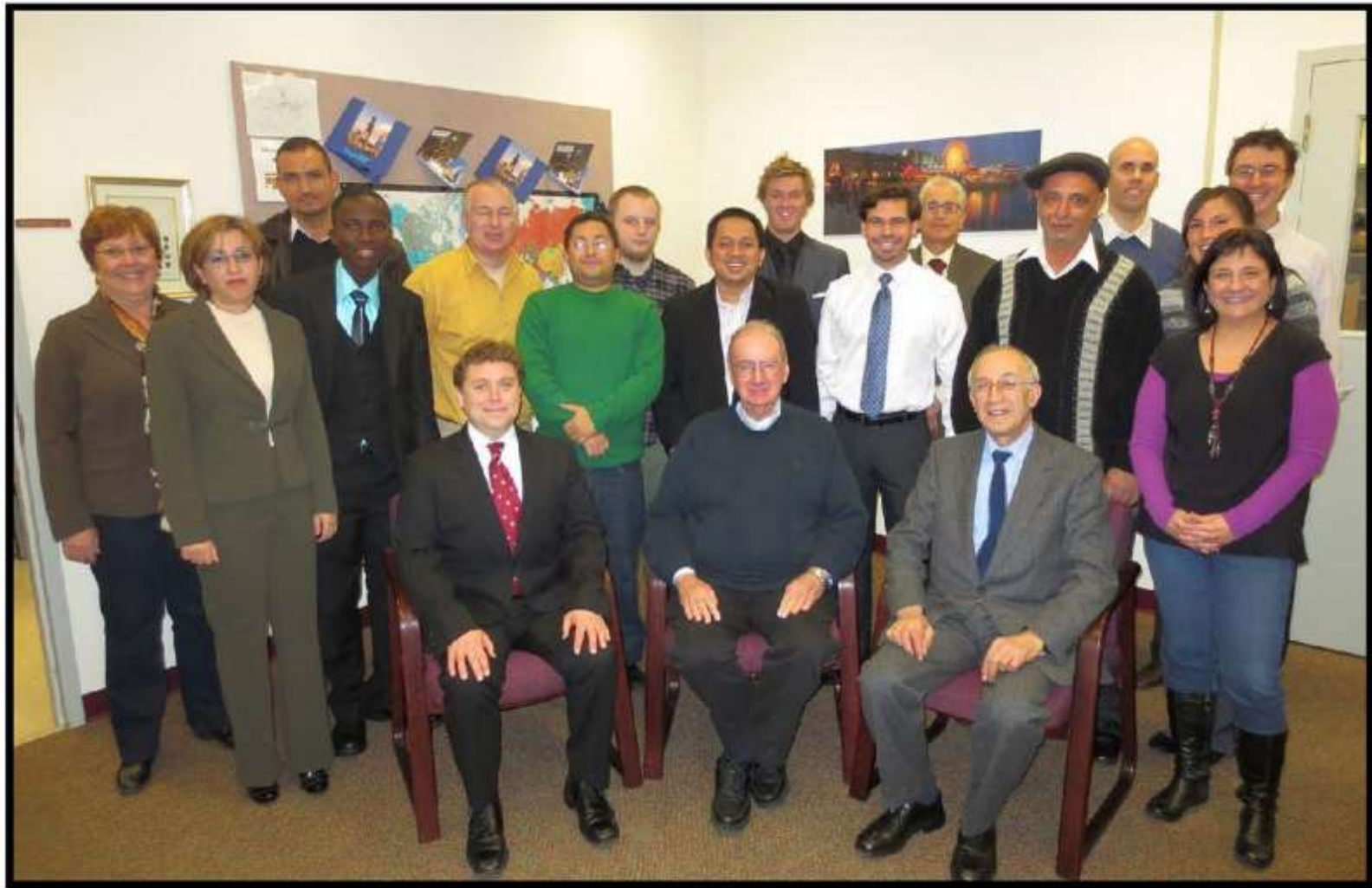
IAEA-Argonne Training Course on Preparation, Review, and Assessment of Safety Documents for Research Reactors