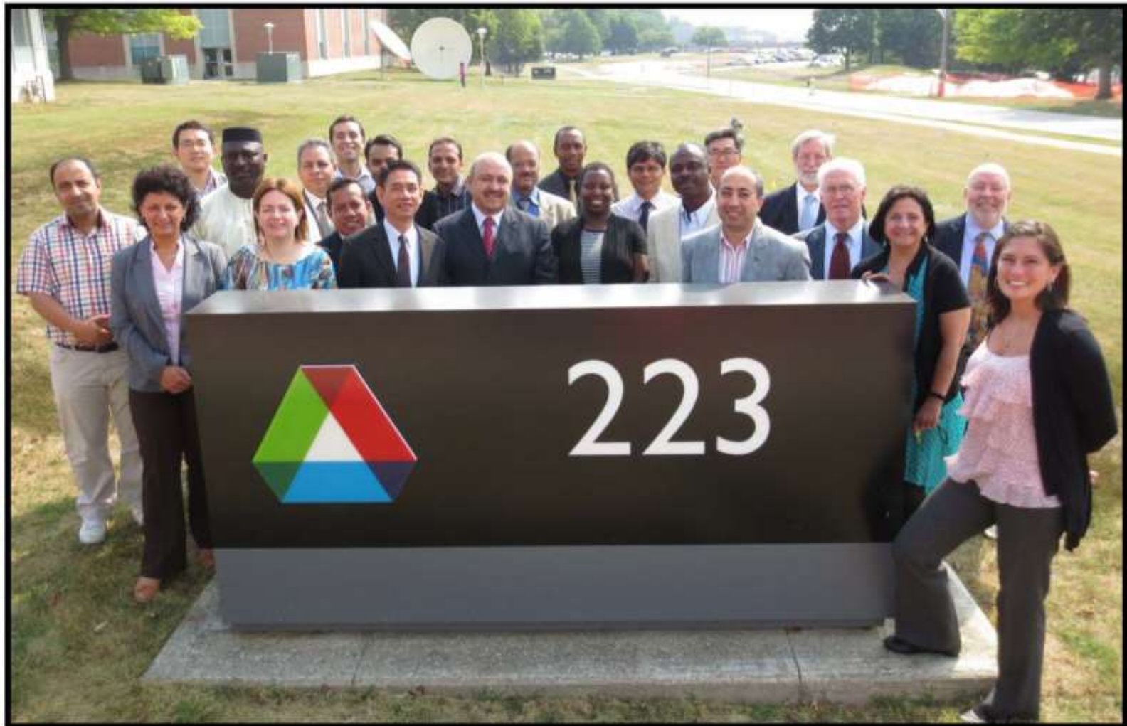
IAEA-Argonne Interregional Training Course on Leadership and Management for Introducing and Expanding Nuclear Power Programmes