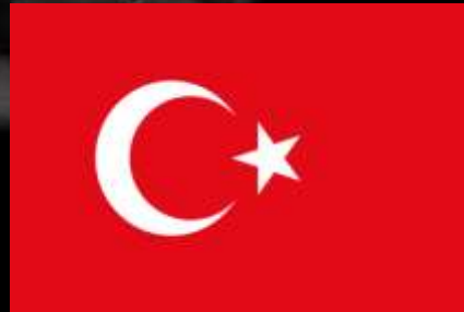
Mehmet BULUT TURKEY