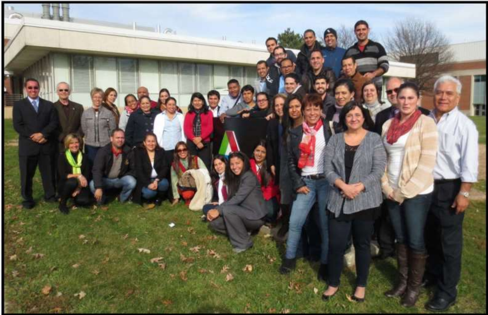
IAEA-Argonne Refresher Regional Training Course for Radiation Therapy Technologists on 3D Radiotherapy