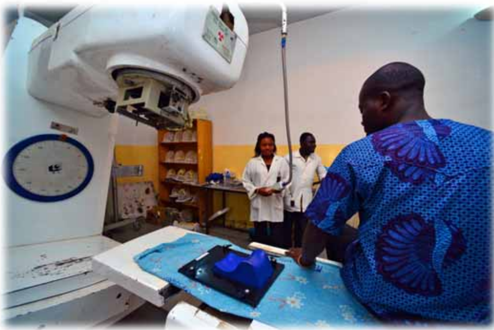
Korle Bu Teaching Hospital, Ghana, January 2013