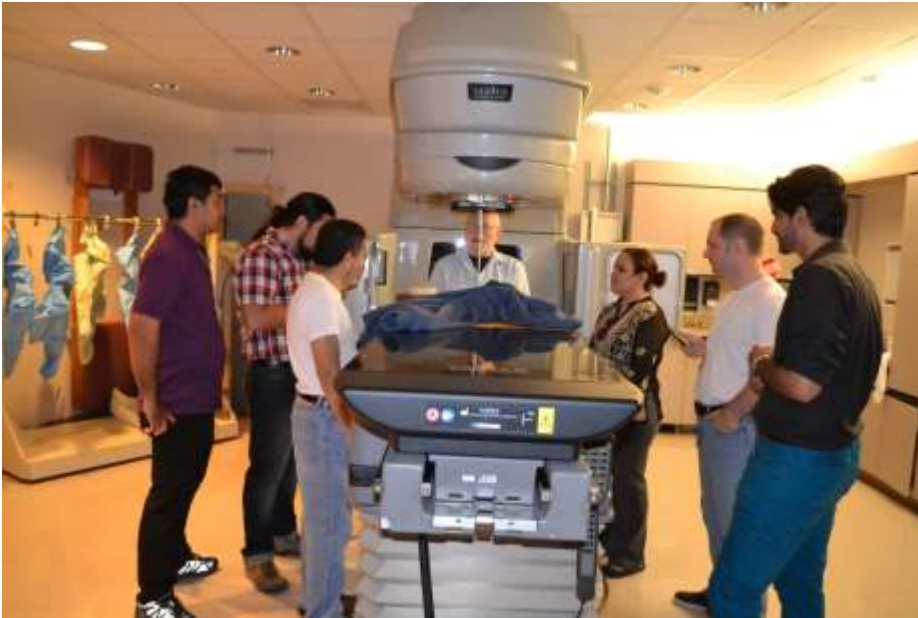
Training at MD Anderson Cancer Center (2015)