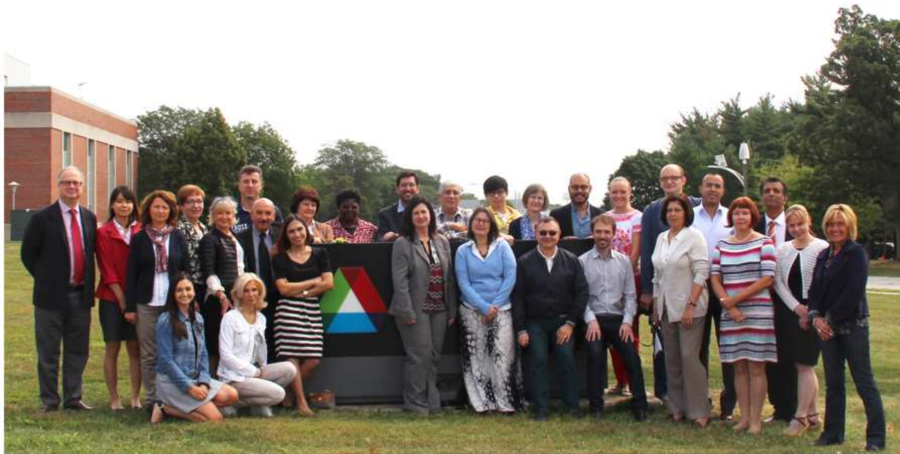
IAEA - Argonne Train-The-Trainer Workshop on Quality Management Audits in Nuclear Medicine Practices (QUANUM)