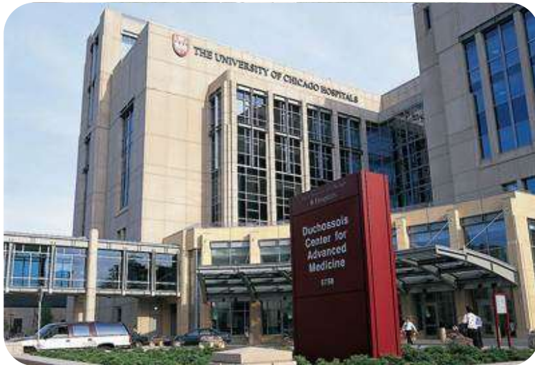
Participants and Lecturers of this course visited the University of Chicago Hospital